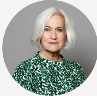
Swedish Minister of Health Care, Acko Ankarberg Johansson

Over seven years, our collaboration has demonstrated that health and care with support of distance spanning solutions is possible for remote citizens across the Nordics. Join us to honor these milestones and hear from the Swedish Minister of Health Care, Acko Ankarberg Johansson, along with other distinguished speakers.