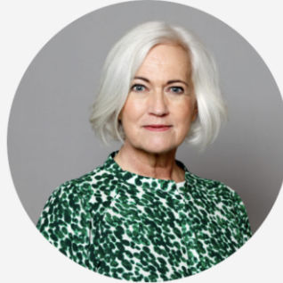
Swedish Minister of Health Care, Acko Ankarberg Johansson

Over seven years, our collaboration has demonstrated that health and care with support of distance spanning solutions is possible for remote citizens across the Nordics. Join us to honor these milestones and hear from the Swedish Minister of Health Care, Acko Ankarberg Johansson, along with other distinguished speakers.